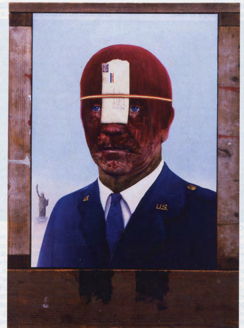
Lucky Adam , 1985, mixed mediums, 50 by 35 by 4 inches. Hammer Museum.