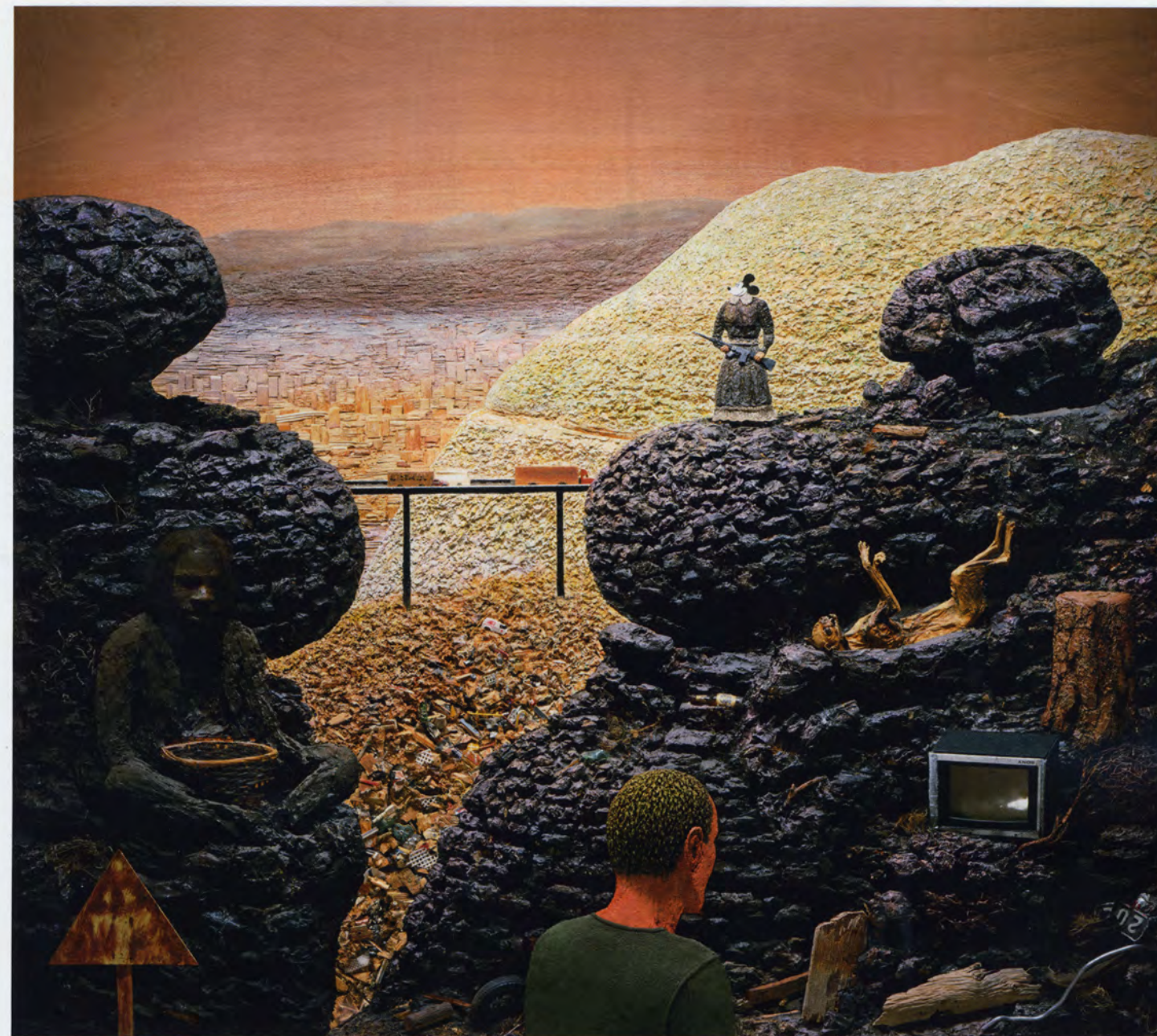
Above, The Lost Frontier , 1997-2005, mixed mediums, 87 by 96 by 8 inches. Hammer Museum, Los Angeles.